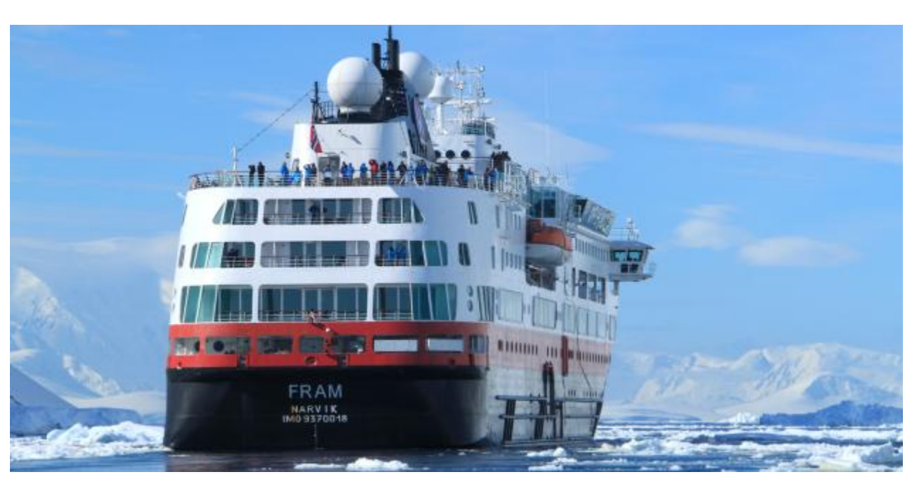
Sailing the Arctic Seas