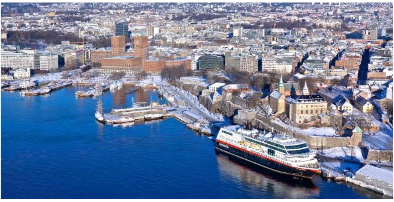
The blue, the green and the city in between